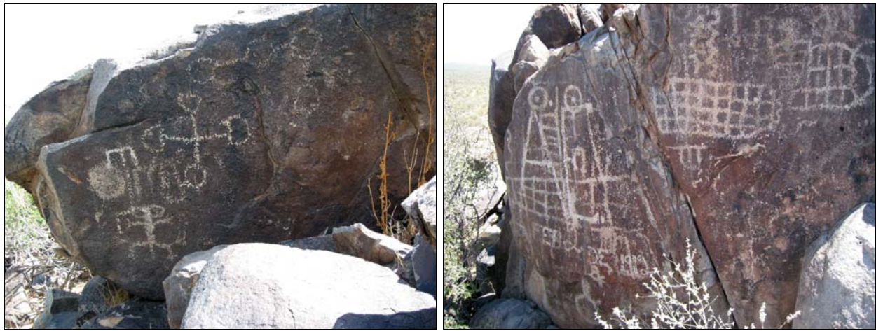
Figure 2. Geometric and reticulate designs on Cocoraque Butte are signs of Huhugam history connecting the Tohono O'odham with their ancient ancestors.

O'odham cultural landscape. 1 The rock images found on Cocoraque Butte provide excellent examples of the Hohokam petroglyphs found in southern Arizona. 2