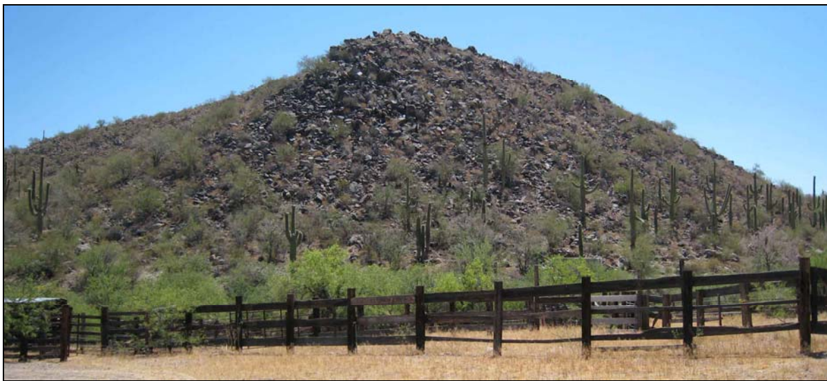
Figure 1. Hundreds of petroglyphs are pecked into the rocks and boulders on the west facing slope of Cocoraque Butte.

On both trips, the Tohono O’odham delegations climbed to the top of the western peak of Cocoraque Butte, examining hundreds of petroglyphs pecked into the dark brown boulders and rocks found on the steep escarpment of the butte (Figure 1).