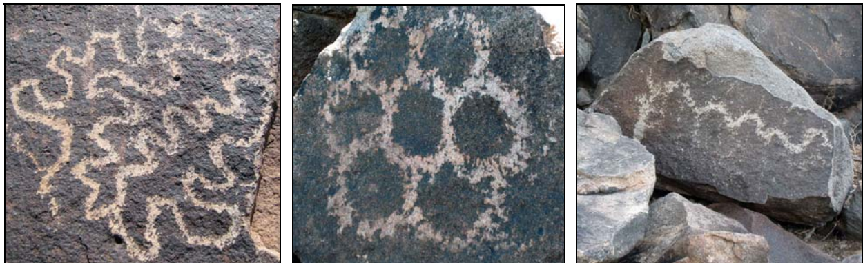
Figure 3. The meandering line petroglyph on the left is a common design from the Archaic Period. O'odham consultants say the cluster of circles in the middle image may represent a cactus flower, while the petroglyph on the right represents a snake. Snakes, lizards, animals, crosses and lightning are familiar designs to the O'odham.