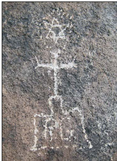
Figure 4. Church petroglyph.